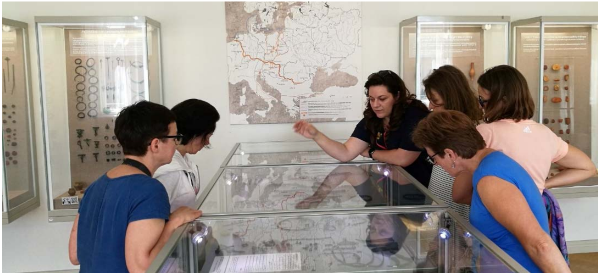
Guided tour in the Museum.

Thus, these European Archaeology Days can contribute to the development of a common identity, while preserving the cultural diversity that characterizes a Europe of multiplicity.