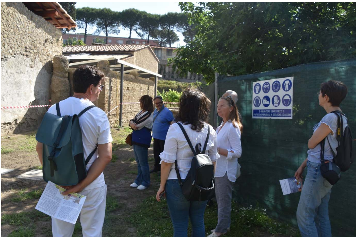
© Site of Pompei, exceptional opening of the Regina site (Italia).

Site of Altamira and Empuriès, Site of Madinat al-Zhara in Córdoba, (Spain)