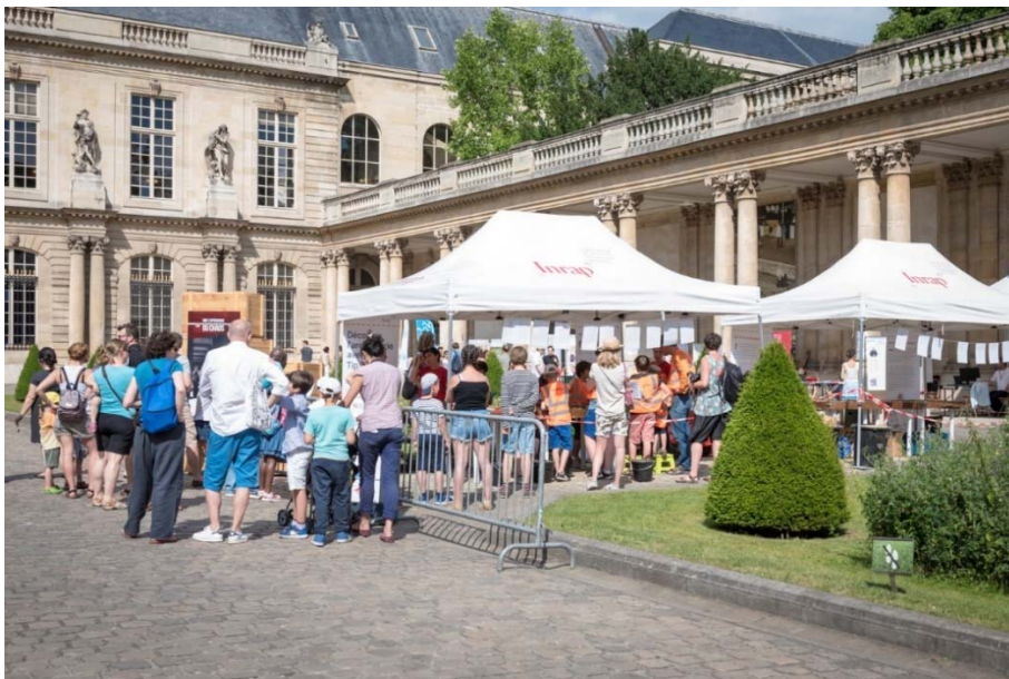
© Hamid Azmoun, Inrap, Paris Archaeology Village in 2017 and 2018

The “Archaeology Villages” will be freely accessible, for activities, demonstrations, meetings and exhibitions, all on a single site, for example, a public square, a hall, a museum, etc. Experiments, demonstrations or basic hands-on activities can be combined with mini-exhibitions, conferences, shows, projections, historical reconstitutions, etc.