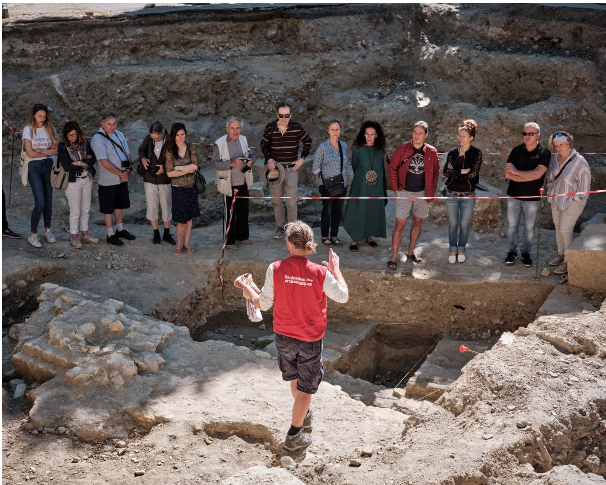
Exceptional opening of the excavation site in Narbonne, (France).

The exceptional opening of excavation sites and research centers to the public is a very important form of action whose concrete approach presents important issues. It is also a way to get away from clichés linked to archaeology and helping people to discover the reality of the profession by meeting the professionals: proximity is essential.