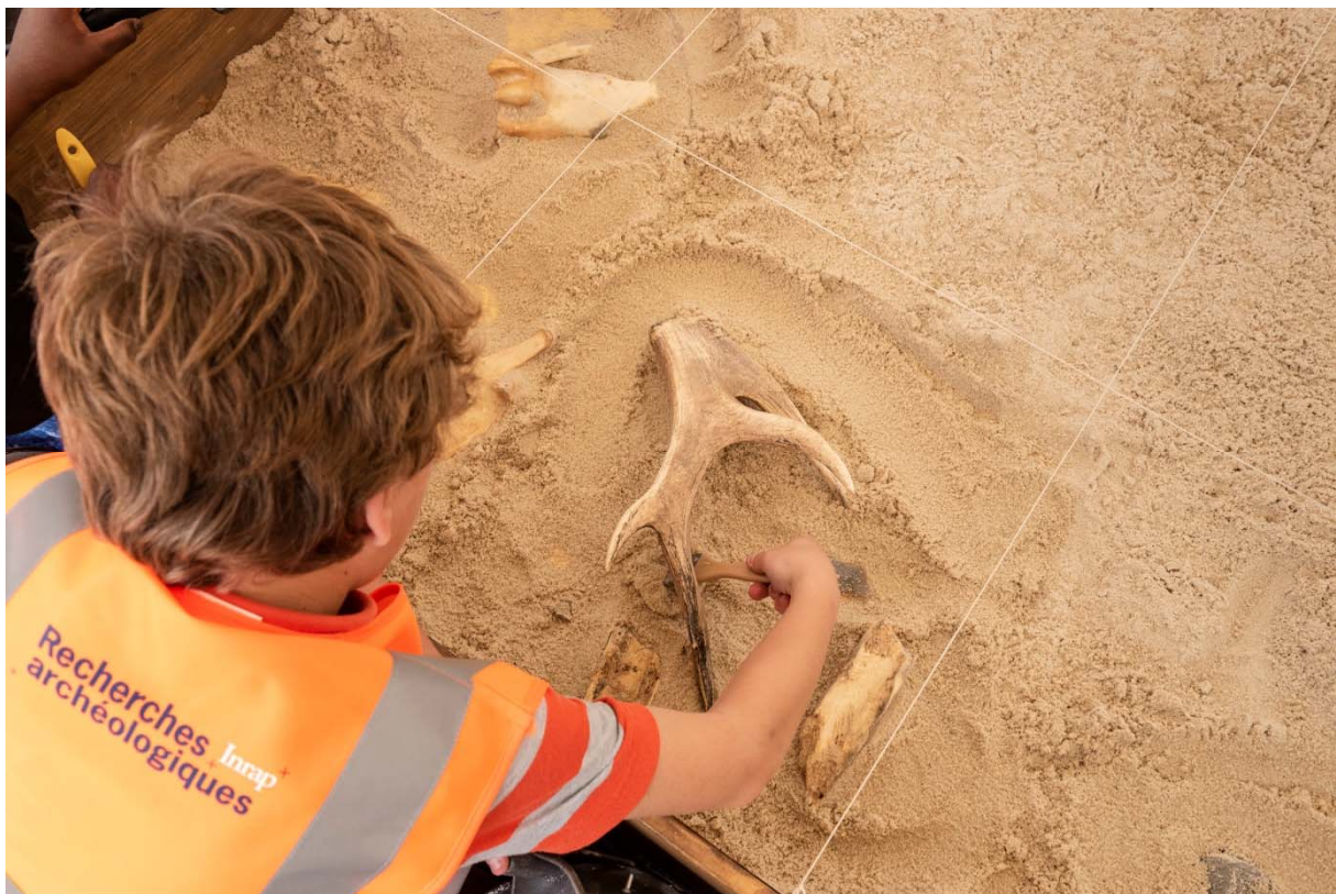
Excavation workshop for children in Marseille, France.

Since 2010, the French Ministry of Culture has been entrusting the National Institute for Preventive Archaeological Research (Inrap) with the co-ordination and promotion of National Archaeology Days, and then with the European Archaeology Days (EADs). With more than 2,200 employees and researchers, the National Institute for Preventive Archaeological Research (Inrap), a public state establishment, under the supervision of Ministries of Culture and Research, is the largest French archaeological research structure and the leading such structure in Europe. It is responsible for carrying out the majority of archaeological diagnostics and a significant part of the excavations, in partnership with private and public developers, i.e. nearly 2,000 sites per year, in mainland and French overseas territories. Its missions extend to the scientific analysis and interpretation of excavation data and the dissemination of archaeological knowledge to the widest possible audience.