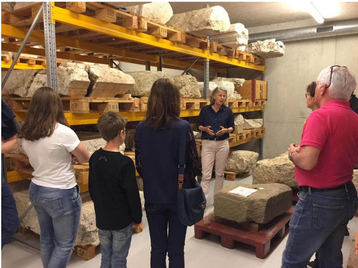
Guided tour of the archaeological repository.

These three days has been used to raise awareness and familiarise European audiences with all aspects of archaeology. A range of original and festive events has be organised, to allow families, schools, students, history enthusiasts or the merely curious to discover this multifaceted discipline and their archaeological heritage. Visits to places that are not normally open to the public (excavation sites, research centres, archaeological collections, etc.), meetings with archaeological professionals (archaeologists, researchers, etc.), who has been describing their profession to the public, along with a range of entertaining and educational activities (an introduction to excavation, demonstrations, workshops, etc.), are just some of the wide variety of programmes available at the European Archaeology Days.