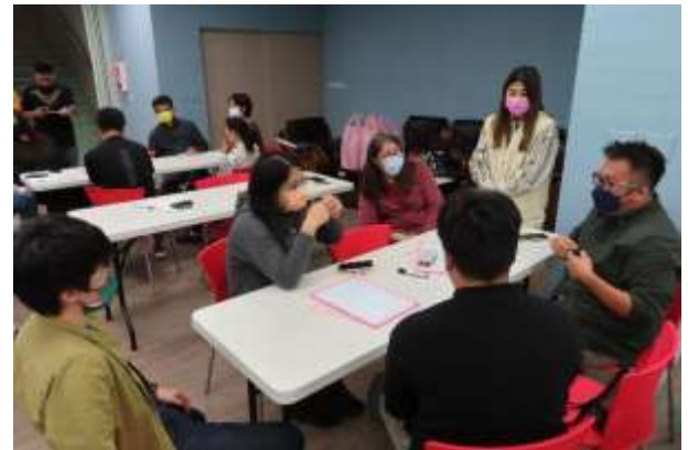
Figure 3. Discussion of how to promote archaeology and archaeological sites to children (photo by Wang Chung-Chun).

Finally, the participants were given a tour of the archaeological sites nearby, namely the stone coffins at He-Ping and Pai-Shou-Lien site. We demonstrated the replicas made by 3D printing before visiting the sites, in order to explain the meaning and usage of the artifacts.