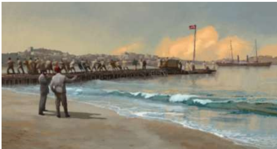
Fig.3 The loading of the Alexander the Great Sarcophagus to the raft (The Istanbul Archaeological Museums Archive).