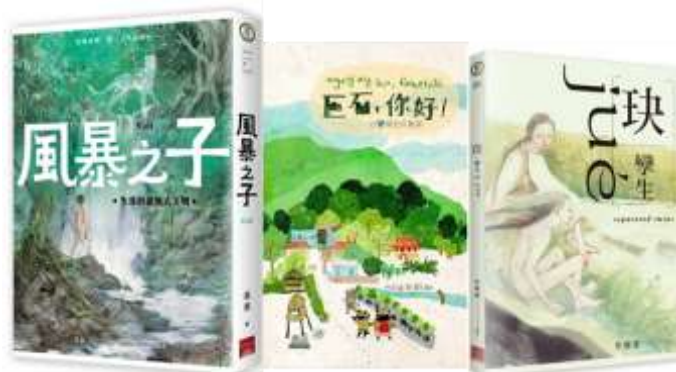
Figure 1. Publications of the NMP, including Hello, Megaliths!, Vali, and Jué: Separated Twins.

This year's project focuses on Chenggong Township, where the megaliths are the highlight of discussion among the NMP's staff, the local youth association and elementary school teachers. The process aims to introduce teachers to basic concepts of archaeology so that they can apply them in their curriculum. Another goal is to encourage the youth association to assist in the preservation of cultural assets through social action. It is hoped that the megaliths in eastern Taiwan serve as a starting point, prompting teachers to look at other "routes" near them for their curriculum planning.