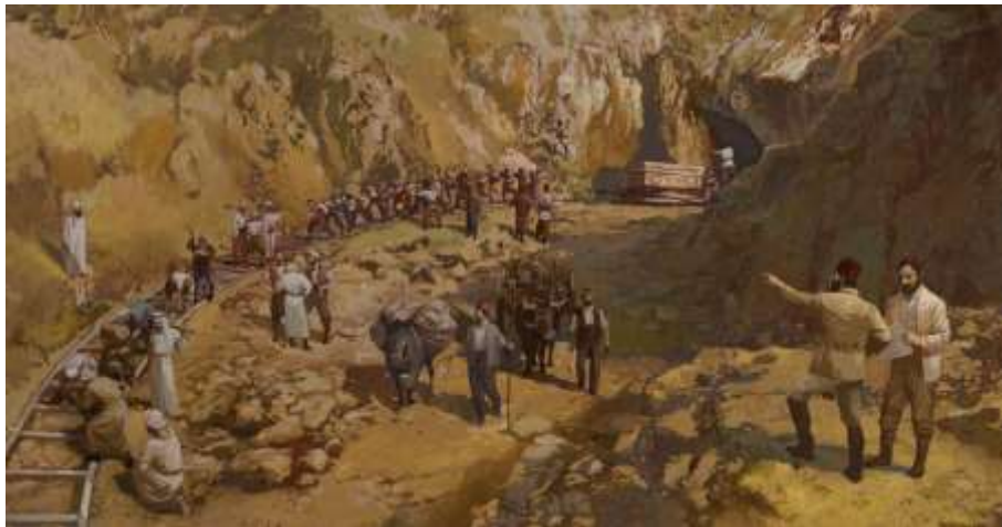
Fig.2 The extracting of Alexander the Great Sarcophagus the Great through the hypogeum.