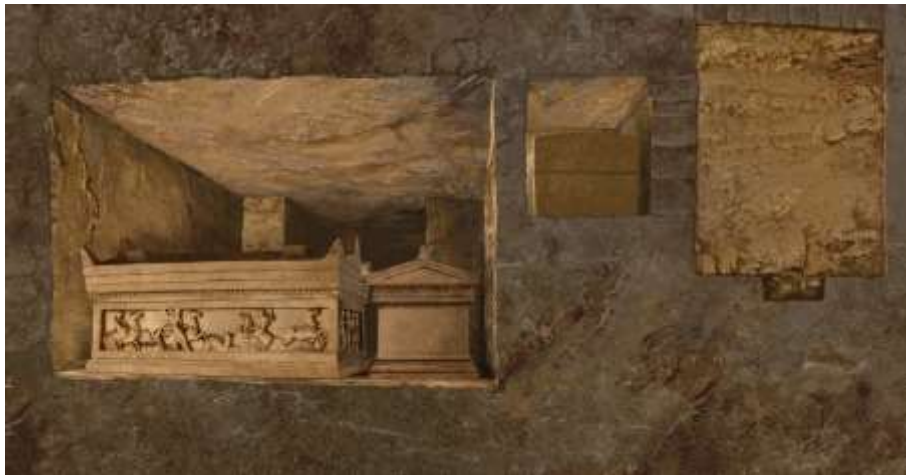
Fig.4 The location of the Satrap Sarcophagus in the underground chamber.