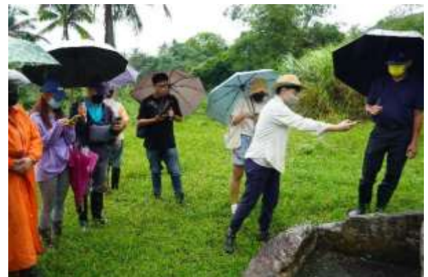
Figure 5. Demonstrating the process of 3D scanning (Figure by Shen Chieh-Hsiu).