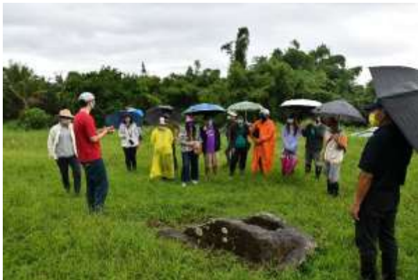
Figure 4. Visiting the stone coffin at He-Ping archaeological site.

At the sites, we explained details of the stone coffin and shared the history of its discovery and research. We also showed the 3D modeling, the archaeological works of survey and surface collection, and also highlighted the importance of preserving cultural heritage. The demonstration of 3D modeling was to explain the use of technology to preserve the archaeological remains. The collection of pottery sherds from the surface was to explain that archaeological sites may just be around the corner.