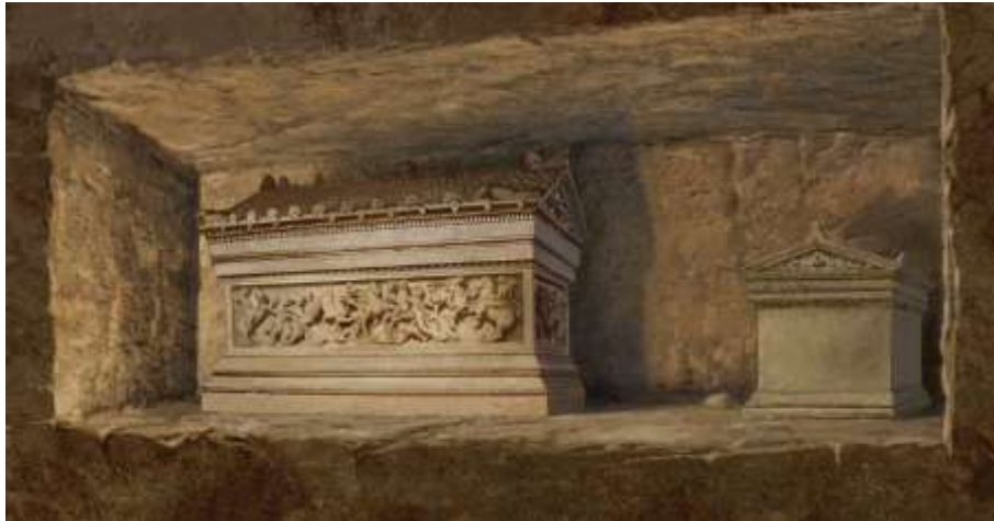
Fig.1 The location of Alexander the Great Sarcophagus in the underground chamber.