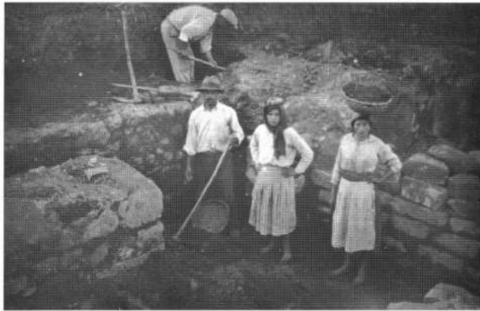
Image 3: Local inhabitants working in Conimbriga excavations in the 1930s.

This situation, as expected, created a great deal of dissension between the museum and its nearby community, to the point that the local inhabitants tend to see the archaeological site as more of a problem than a valuable heritage resource that could benefit the local development. They also feel excluded from the revenues generated by the flow of visitors attracted by the museum and the ruins, that doesn't bring benefits to the community, and do not see themselves represented in museum displays and activities, despite their involvement since the first archaeological excavations. As a result, their vast historical and cultural heritage is not considered by the community as something important for its identity or for its economy.