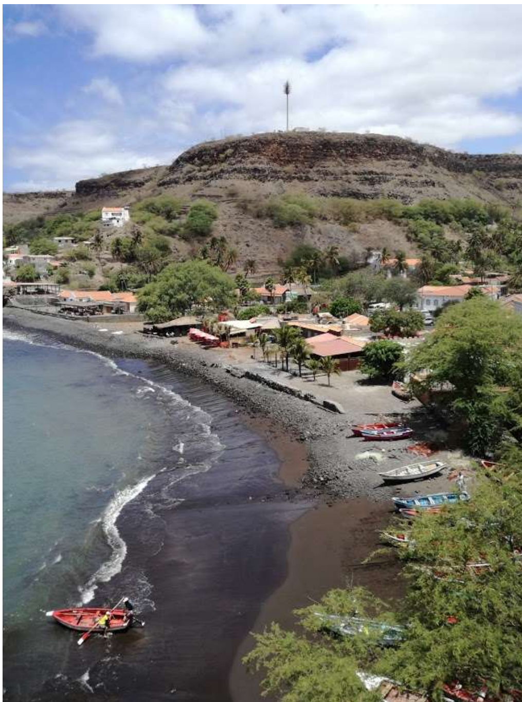
Image I - Ribeira Grande de Santiago

After the independence, for many years, there were no consistent cultural policies directed towards to museums in Cape Verde, because it's government privileged the consolidation of the economic and social areas, despite popular Cape Verdean culture have had a lot of highlights 4 .