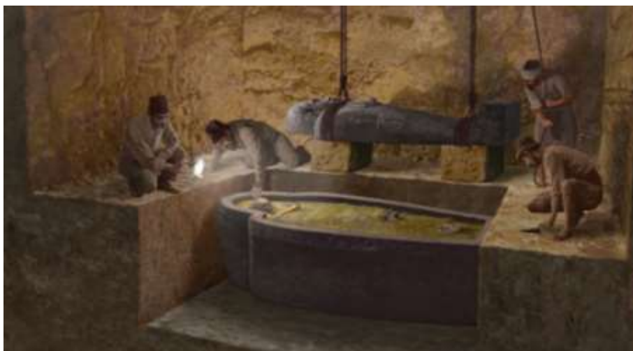
Fig. 6 Discovery of the Tabnit Sarcophagus (The Istanbul Archaeological Museums Archive).