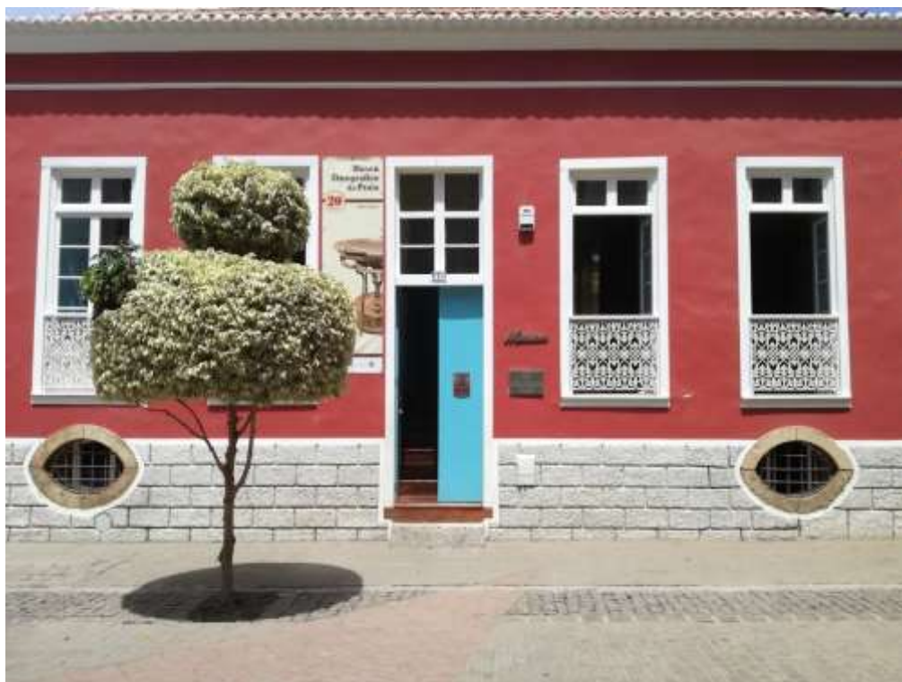
Image II - Ethnographic Museum building