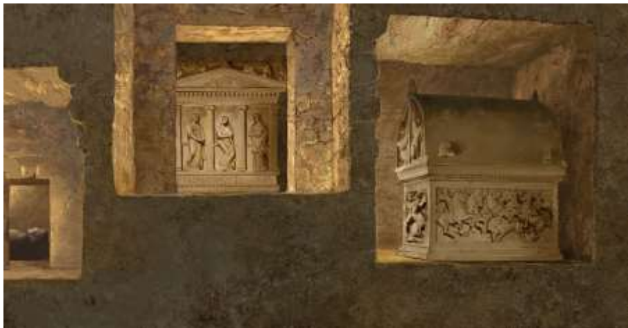
Fig. 5 location of the Lycian and Mourning Women Sarcophagi in the underground chamber.